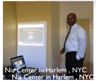
Nia Center in Harlem, NYC Nia Center in Harlem, NYC